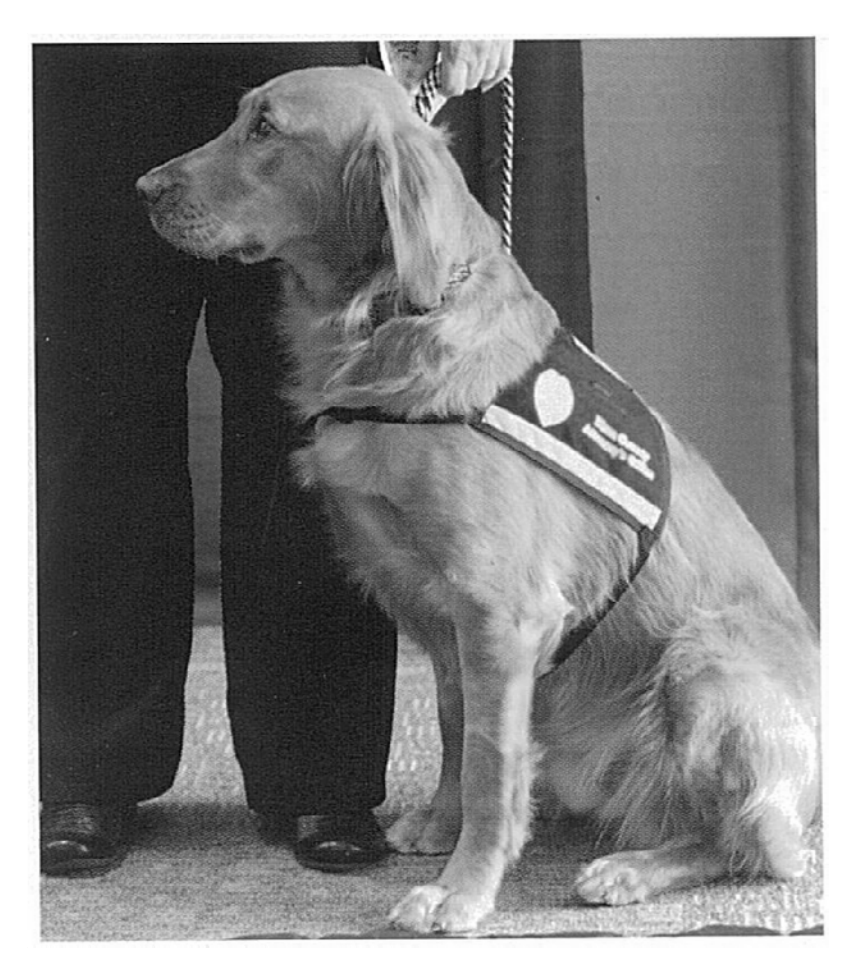
Russell,\ certified,\ professional\ Courthouse\ Dog.