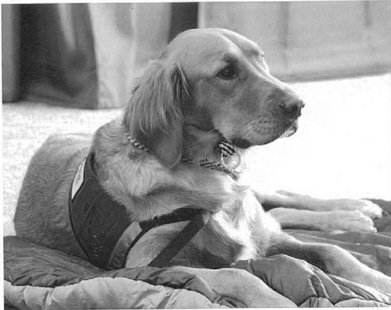
Russell, Golden Retriever

Special Staff Assistant to the Pima County Attorney